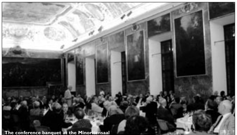
The conference banquet at the Minoritensaal