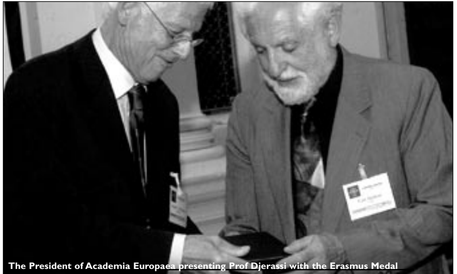
The President of Academia Europaea presenting Prof Djerassi with the Erasmus Medal

The ERASMUS medal is awarded by the Council to eminent members whose individual scholarship has made a substantial contribution to European excellence across the Sciences, Humanities and Letters.