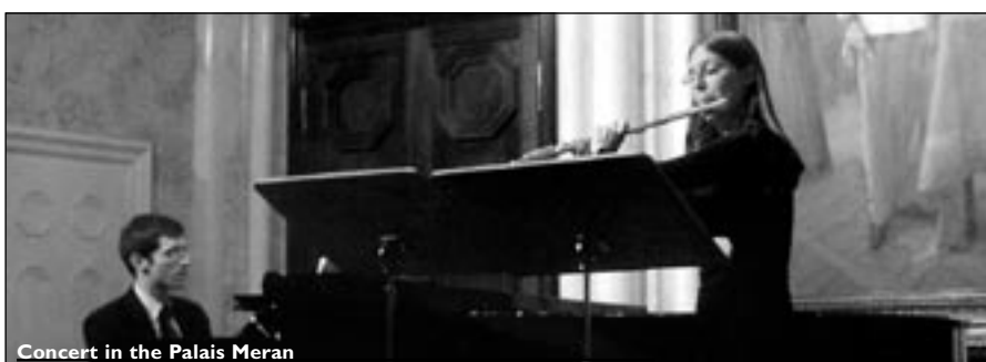
Concert in the Palais Meran