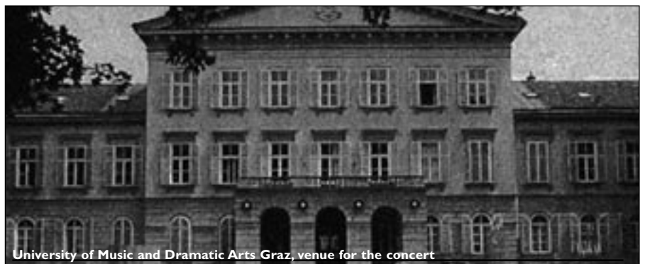
University of Music and Dramatic Arts Graz, venue for the concert