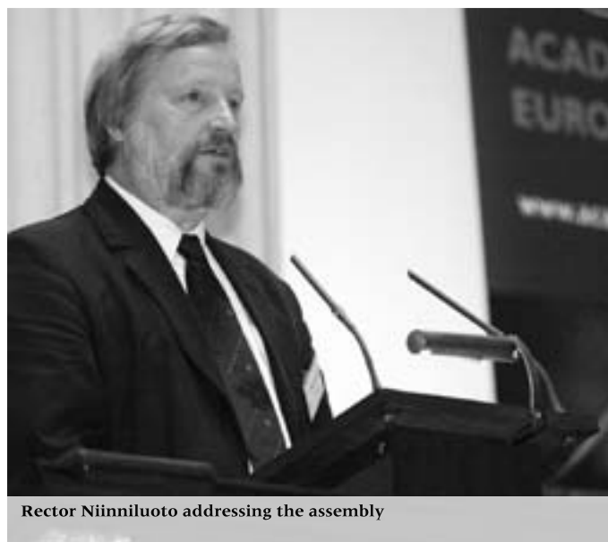
Rector Niiniluoto addressing the assembly