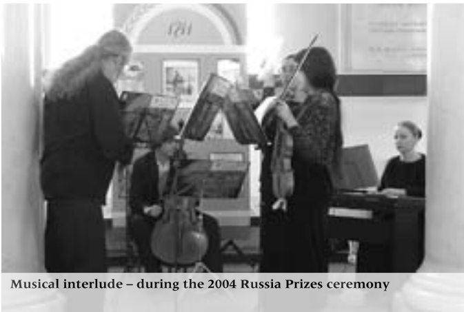
Musical interlude – during the 2004 Russia Prizes ceremony