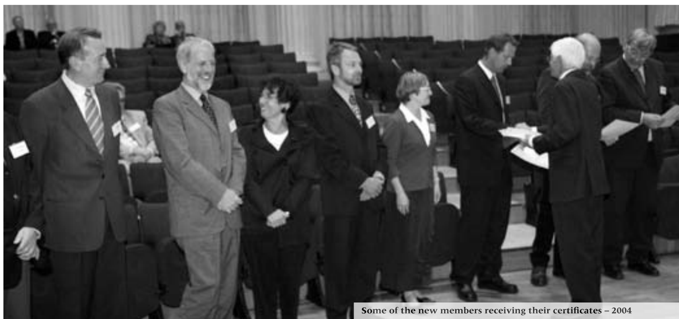
Some of the new members receiving their certificates – 2004

Don't forget: registrations for this year's conference in Berlin-Potsdam are now open. Put the date into your diaries 22 –24 September. Please come and celebrate the 'International Year of Physics', 'Einstein year' and the 'Year of Planet Earth', with fellow members of your Academy. See www.acadeuro.org for programme and registration details.