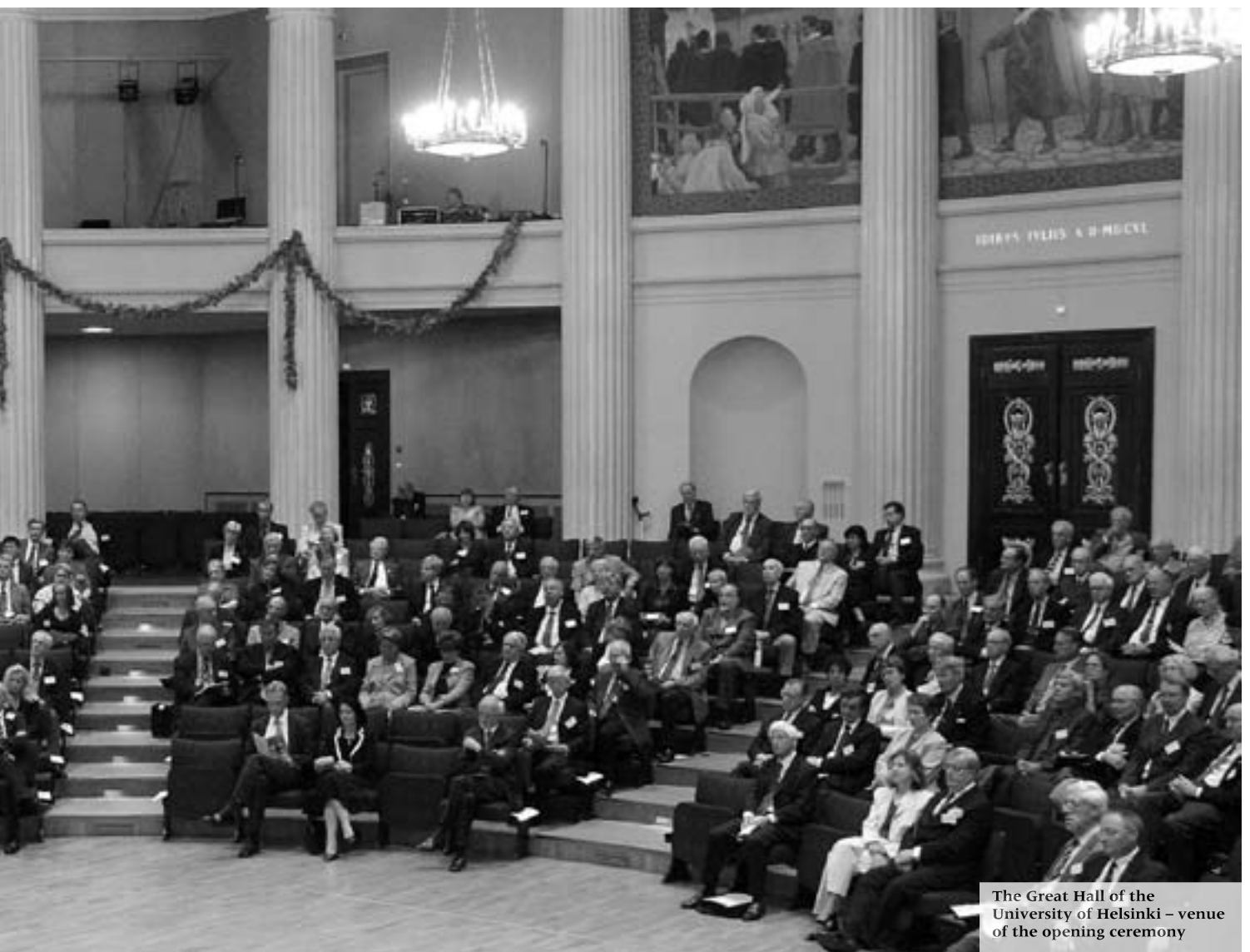
The Great Hall of the University of Helsinki – venue of the opening ceremony